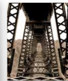
Pittsburgh Post-Gazette One Tank Trip Advertisement