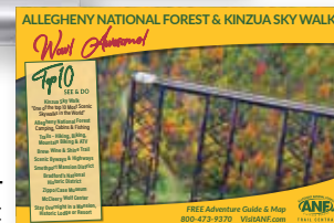
Happy Traveler Advertisement