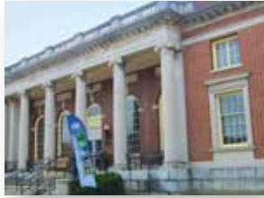
ANF Visitors Bureau Welcome Center

The ANF Visitors Bureau strives to increase the economic benefit of new net revenue into our region by increasing: