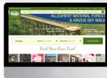
New website VisitANF.com