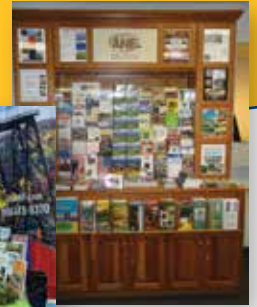
ANF Visitors Bureau Information Kiosks