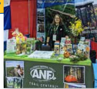
Representing the Region at Trade Shows