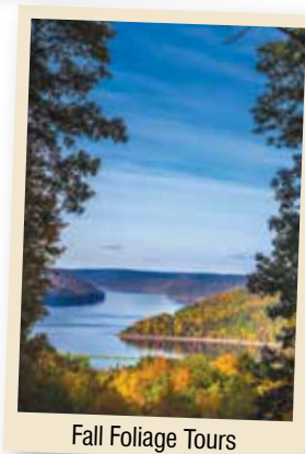
Fall Foliage Tours

Cruise along the Longhouse National Scenic Byway with your step-on-guide. Scenic stops include the Allegheny Reservoir, Kinzua Dam and Rimrock Overlook. Lunch at Kane Manor , tour the Kane Depot/McCleery Discovery Center . In the afternoon, travel to the amazing Kinzua Sky Walk , and enjoy a nature program at the Kinzua Bridge State Park.