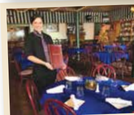
Dinner Theater at Beefeaters Restaurant

Bradford's history as a rich oil boom town of the late 1800s is showcased at the Penn Brad Oil Museum . The Zippo lighter, invented in Bradford, is the story told at the Zippo/Case Museum where you can shop for Zippo lighters and Case knives. Within Bradford's National Historic District enjoy a dinner theater performance at Beefeaters Restaurant . In the morning, learn about America's heroes at the Eldred WW II Museum , then travel to the site of the tornado of 2001—where the Kinzua Sky Walk was re-invented from the historic 1882 Kinzua Viaduct.