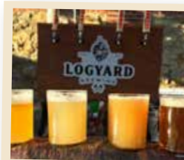
Food & Wine Trails

Arrive in time for a luncheon and hands-on Baking Class at John Williams European Pastry Shop . Then off to CJ Spirits for a tour and tasting at their craft distillery. In Kane, visit an old-fashioned family-owned market – Bell's . (Pack your coolers.) Explore Logyard Brewing, Twisted Vine Beverage or Table 105 for tastings. Finish your day with wine tasting and an authentic Italian meal at Flickerwood Wine Cellars in Kane.