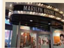
Marilyn Horne Museum