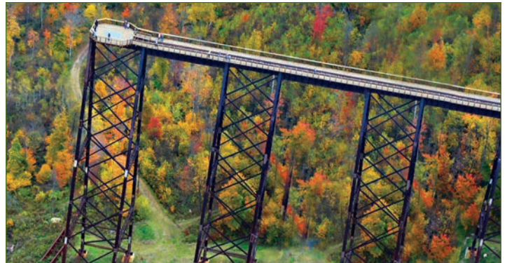
“One of the top 10 most scenic skywalks in the world,” The Culture Trip, U.K.

In the Allegheny National Forest the sky is more vast, the mountains higher, the trees a bit taller. McKean County is known as Trail Central because of the over 600 miles of year-round multi-use trails. Cruise the Longhouse National Scenic Byway, the Kinzua Bridge Scenic Byway and Pennsylvania Route 6 to get into the heart and soul of America.